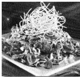
Crunchy Spinach Salad

Choice of Appetizer Salad and Bowl of Soup. 13.25