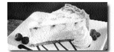
Raspberry White Chocolate Cream Cheese Pie