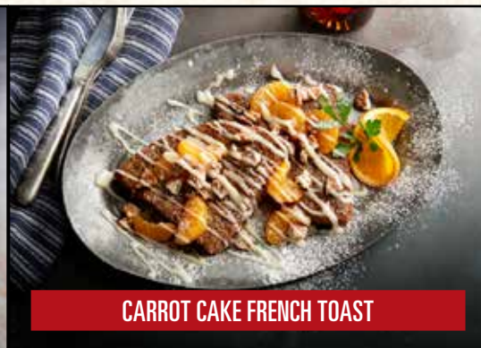
CARROT CAKE FRENCH TOAST