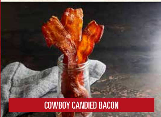
COWBOY CANDIED BACON

Grey Goose Vodka, Kahlúa Coffee Liqueur, chilled black coffee, simple syrup and a pinch of salt (640 cal) 10