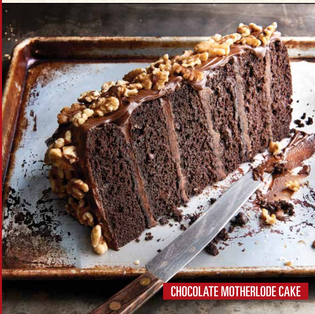
CHOCOLATE MOTHERLODE CAKE

Double Chocolate Chip Cookie (880 cal) 3.99