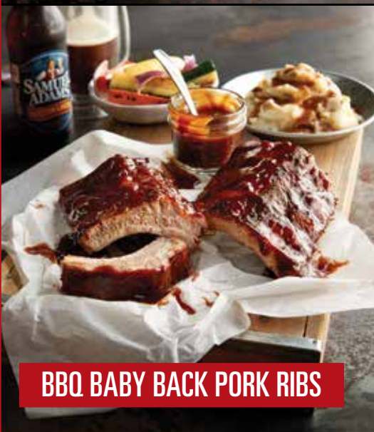
BBQ BABY BACK PORK RIBS

TOP SIRLOIN* Certified Angus Beef® top sirloin 7 oz (570 cal) 20.99 9 oz (700 cal) 22.99