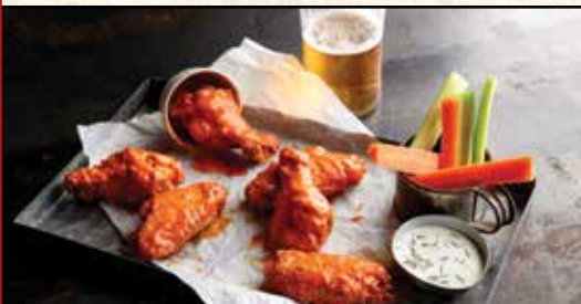
BUFFALO CHICKEN WINGS

Disclaimer: We have prepared this menu based on the most current information available from our suppliers and their stated absence of gluten within these items. While we use caution in preparing our gluten-sensitive menu items, our kitchen is not gluten-free. Since our dishes are prepared-to-order, during normal kitchen operations, we cannot guarantee that cross-contamination with foods containing gluten will not occur. We encourage you to carefully consider your dining choices and your individual dietary needs when dining with us. When placing your order, please let your server know that you are ordering a gluten-sensitive menu item.