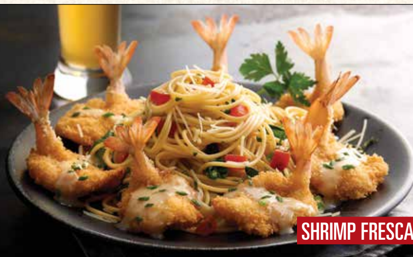
SHRIMP FRESCA PASTA

JAMBALAYA PASTA Our version of this Louisiana favorite, sautéed peppers, red onions, andouille sausage, roasted chicken, shrimp, pasta, Creole gravy (1280 cal) 19.99