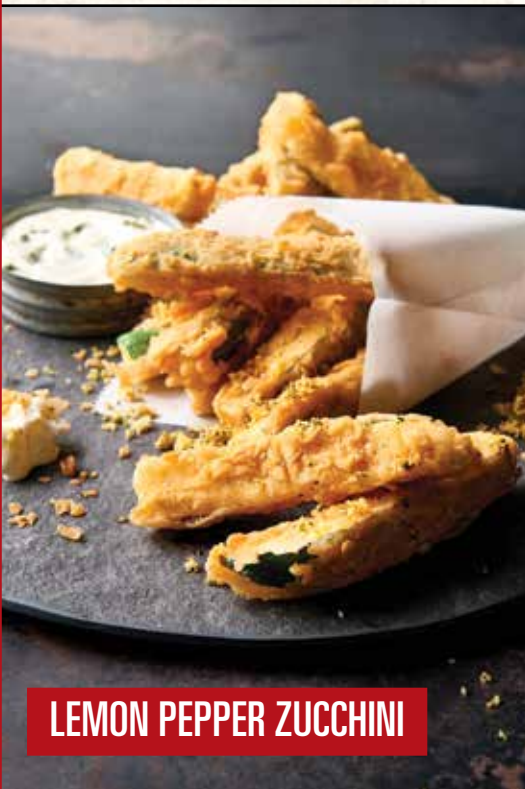
LEMON PEPPER ZUCCHINI

Please specify VEGETARIAN when ordering from this menu. These menu selections contain no meat, fish, poultry, shellfish or product derived from these sources, but may contain dairy or eggs. Please be aware that non-vegetarian products are prepared in our restaurant and, therefore, cross contamination may occur