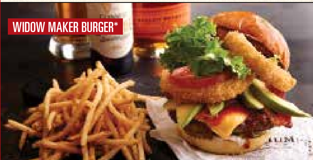
WIDOW MAKER BURGER*