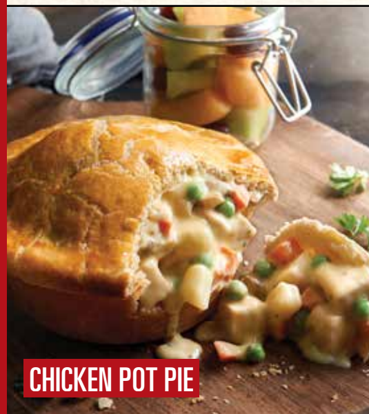
CHICKEN POT PIE

AFTER THE GOLD RUSH Grilled chicken breast, Marsala wine, mushrooms, roma tomatoes, mashed potatoes (890 cal) 19.99