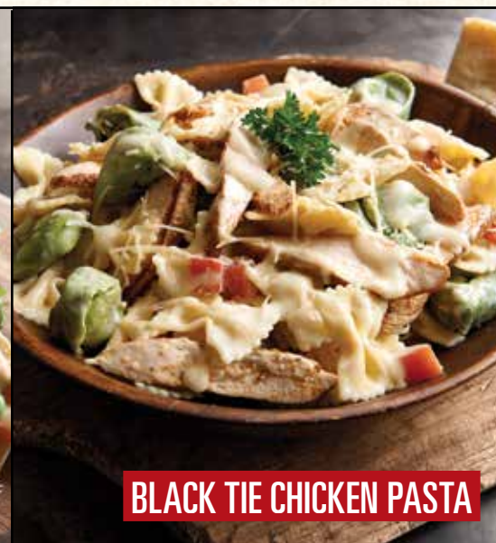
BLACK TIE CHICKEN PASTA