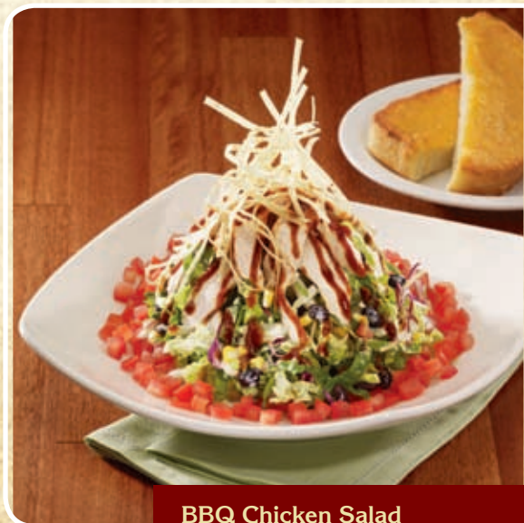
BBQ Chicken Salad

Seared Ahi Spinach Salad* Center-cut ahi seared and sliced over crunchy noodles, diced red onions, tomatoes, Mandarin oranges, dried cranberries, feta cheese, glazed pecans, sesame seeds and our homemade balsamic vinaigrette dressing 15.79