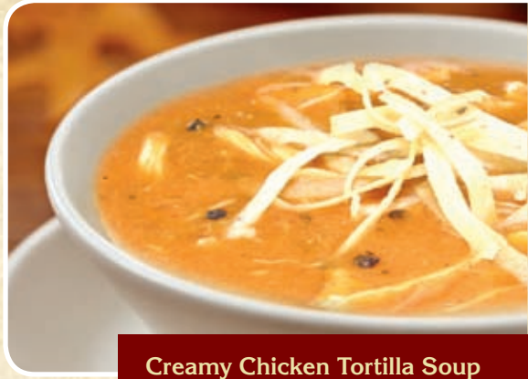
Creamy Chicken Tortilla Soup

Sourdough Bowls Your choice of New England Clam Chowder or Potato Cheddar. Served in a toasted sourdough bowl 8.99 Steak Chili 10.99