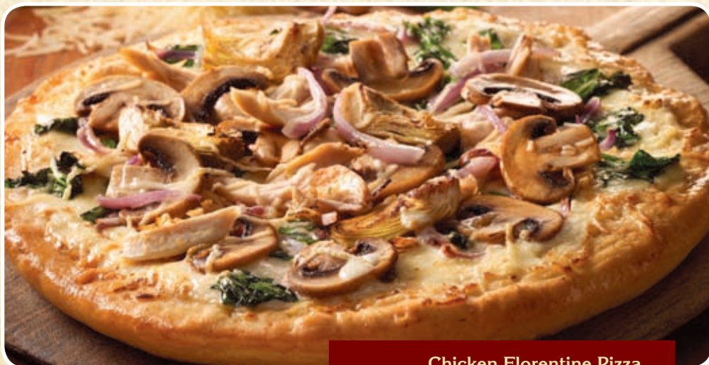
Chicken Florentine Pizza