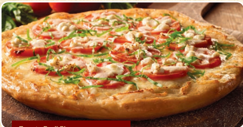
Tomato Basil Pizza