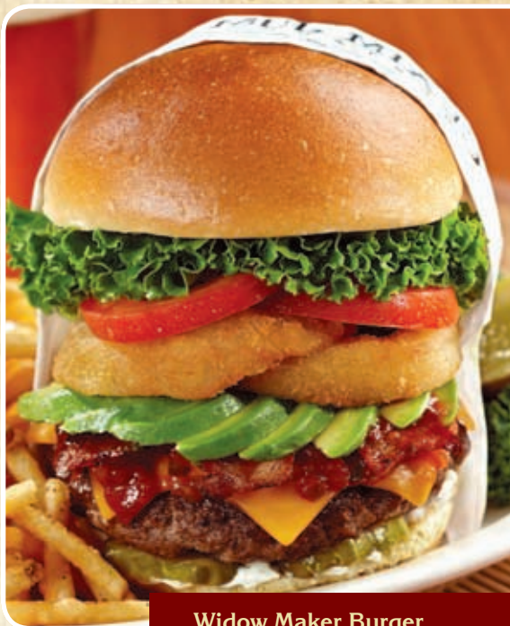
Widow Maker Burger

Clubhouse Sandwich Sliced turkey, sweet ham, smoked bacon, Swiss, smoked gouda and garlic aioli 12.99 Add avocado 1.49