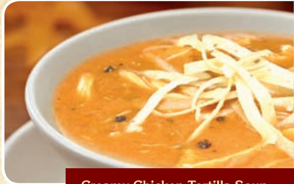
Creamy Chicken Tortilla Soup

Sourdough Bowls Your choice of New England Clam Chowder or Potato Cheddar. Served in a toasted sourdough bowl 8.99 Steak Chili 10.99