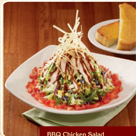
BBQ Chicken Salad

Seared Ahi Spinach Salad* Center-cut ahi seared and sliced over crunchy noodles, diced red onions, tomatoes, Mandarin oranges, dried cranberries, feta cheese, glazed pecans, sesame seeds and our homemade balsamic vinaigrette dressing 15.79