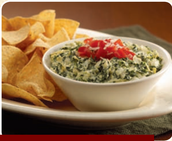
Spinach Artichoke Dip

Appetizer Combo Something for everyone! Buffalo Wings, Fried Zucchini, Mozzarella Sticks, Loaded Skins, Hand-Battered Onion Rings, Southwest Eggroll and Fire-Roasted Artichoke with dipping sauces. No substitutions, please 21.49