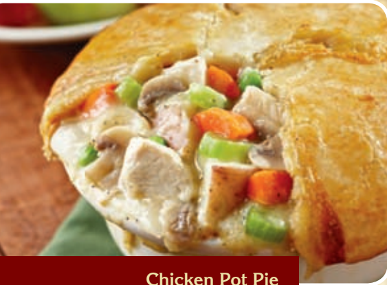
Chicken Pot Pie

Add Cup of Soup, Small Green or Small Caesar Salad 3.99