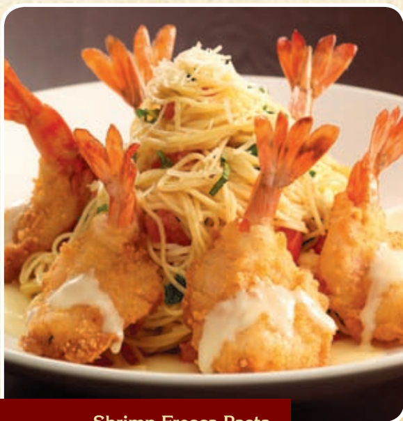
Shrimp Fresca Pasta

Black Tie Chicken Pasta Blackened chicken, bow tie pasta, spinach tortellini and oven roasted tomatoes tossed in creamy Alfredo sauce 11.99