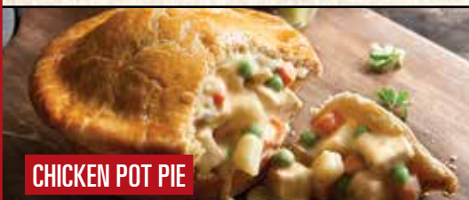
CHICKEN POT PIE

ROASTED TRI-TIP AND SHRIMP* Served only Medium Rare to Medium with mashed potatoes, roasted vegetables