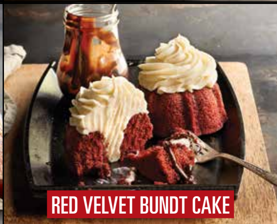
RED VELVET BUNDT CAKE