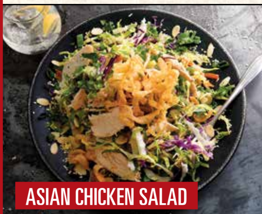
ASIAN CHICKEN SALAD