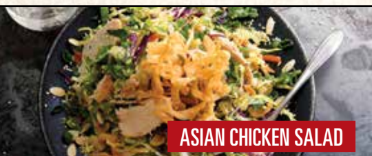
ASIAN CHICKEN SALAD

Claim Jumper is a 100% trans-fat free restaurant. Gluten-sensitive menu available, ask your server.