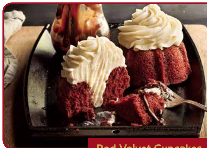
Red Velvet Cupcakes

Fresh-Baked Chocolate Chip Cookies and Chocolate Brownies