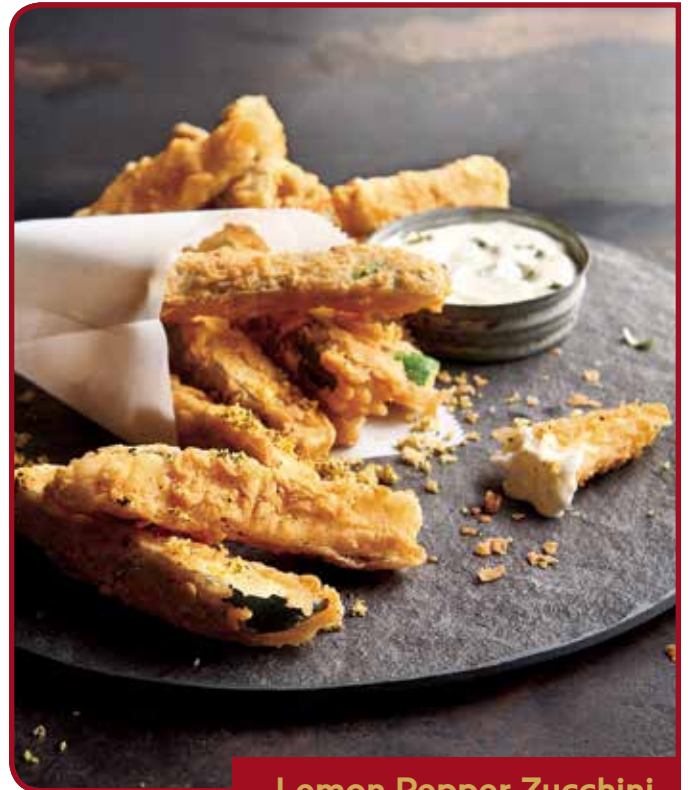
Lemon Pepper Zucchini

Fresh vegetables with dip, fresh fruit, chips and salsa and your choice of three items above