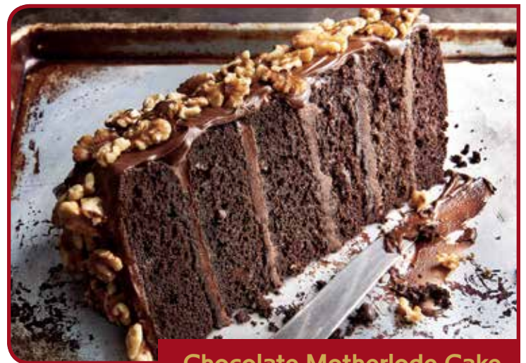
Chocolate Motherlode Cake

Chocolate Brownies, Original Scratch Carrot Cake, Chocolate Chip Cookies, Red Velvet Cupcakes